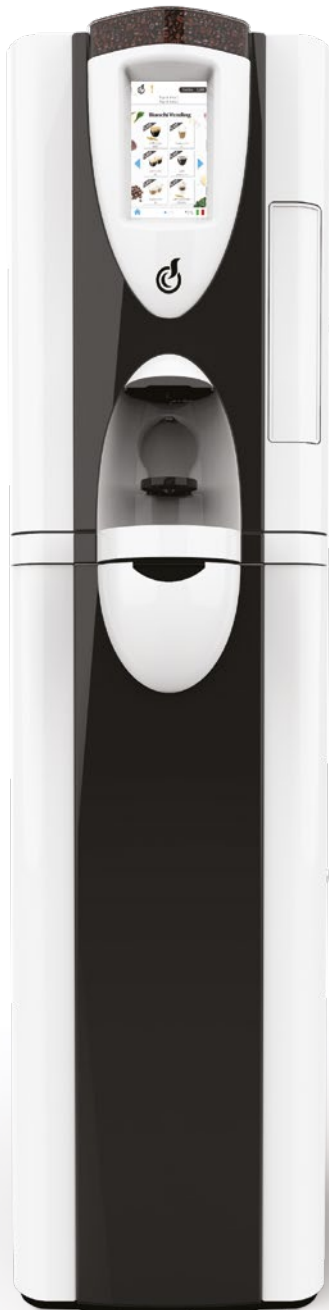
LEI SA RY TOUCH 7" + CABINET