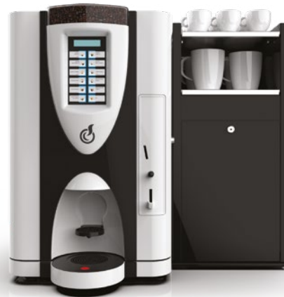
LEI SA RY EASY + FRESH MILK MODULE (optional accessory)

LEI SA RY, a semi-automatic OCS (Office Coffee Service) machine offering coffee in all its various flavours.