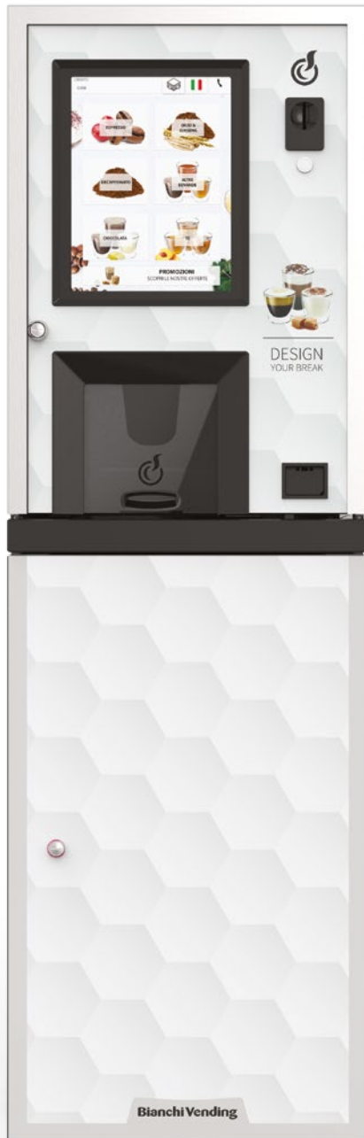
LEI250 TOUCH15" + CABINET STICKER KIT WITH "DESIGN YOUR BREAK" GRAPHIC (OPTIONAL)