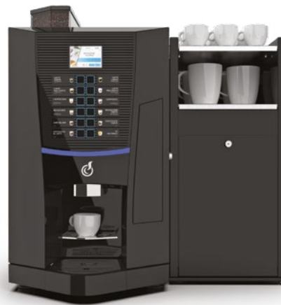
TALIA EASY + FRESH MILK MODULE (optional accessory)

TALIA, the semi-automatic solution to create a complete and efficient coffee area with a design capable of enhancing any environment.