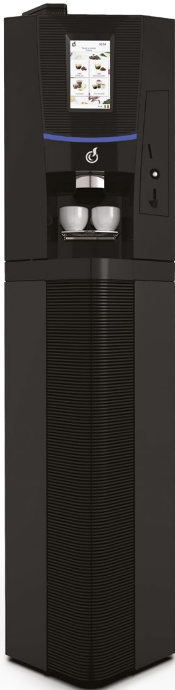
TALIA TOUCH 7" + BLACK CABINET